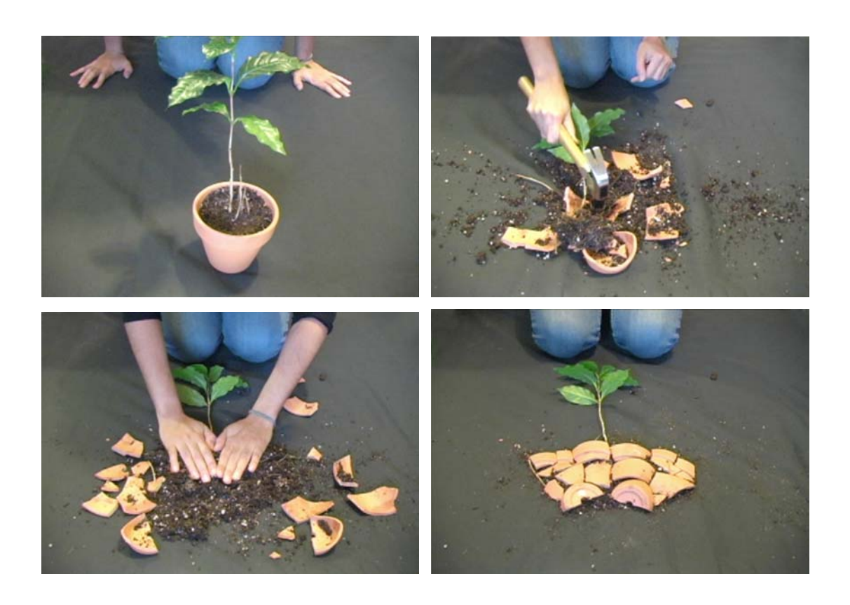
Figure 2. Plant. Video stills. Digital video loop, 10 min. 2010.