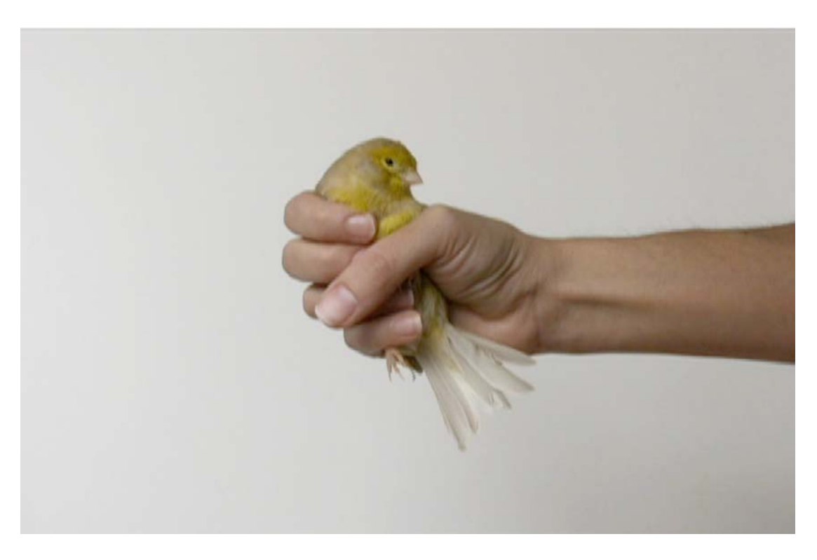
Figure 3. Bird. Video still. Digital video loop, 3 min, 2010.